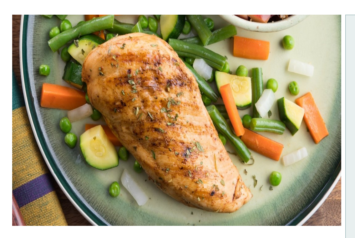
Nutritiously balanced and easy to prepare. A large variety of diet specific choices and